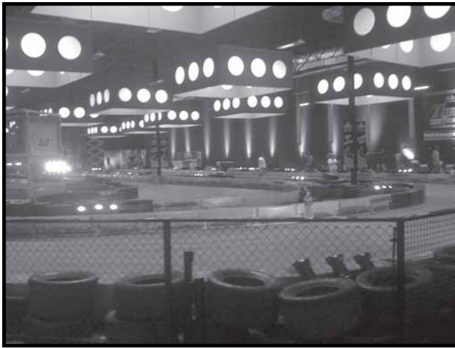
Trick floor rigging in a House car racing scene gave a sense of speed while fully lighting the cars when they passed.