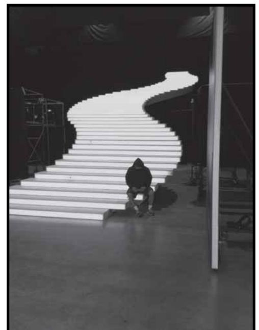
Over 800 feet of LED were used to light the stairway of a 7th season, ambitious yet small rig used in a musical scene for an episode that featured multiple dream sequences.