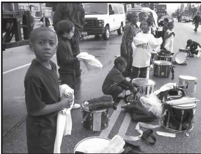
The rain didn't dampen any spirits during the parade, including these young, inspiring participants.